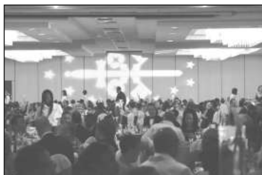
Scenes from previous years' benefits