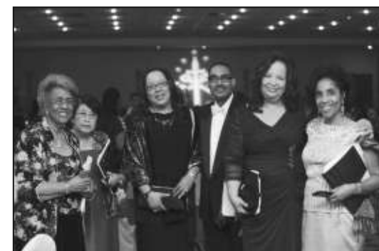
Scenes from previous years' benefits